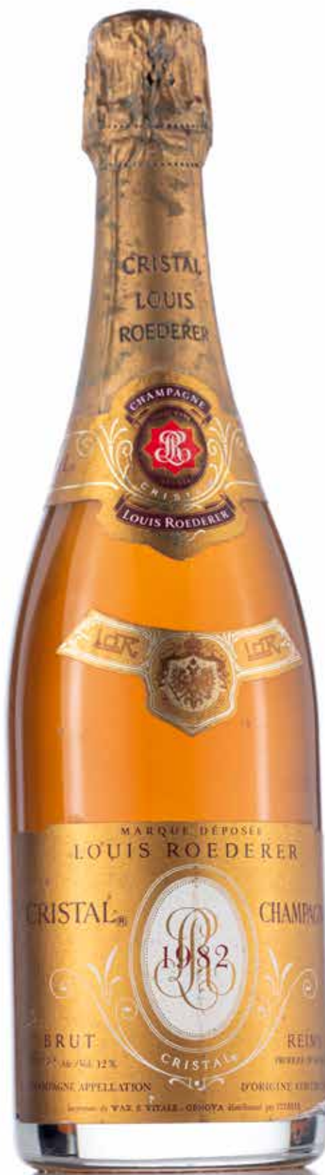
Lots 193 & 195